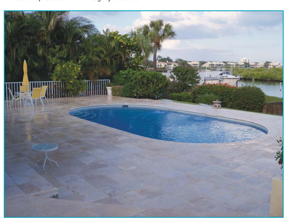
You can make your pool go from mundane to amazing by calling Cliff's Pools and Patios, the resurfacing experts.

Summer is here. It's time to make the smart choice. Call Cliff's Pools and Patios for a consultation.