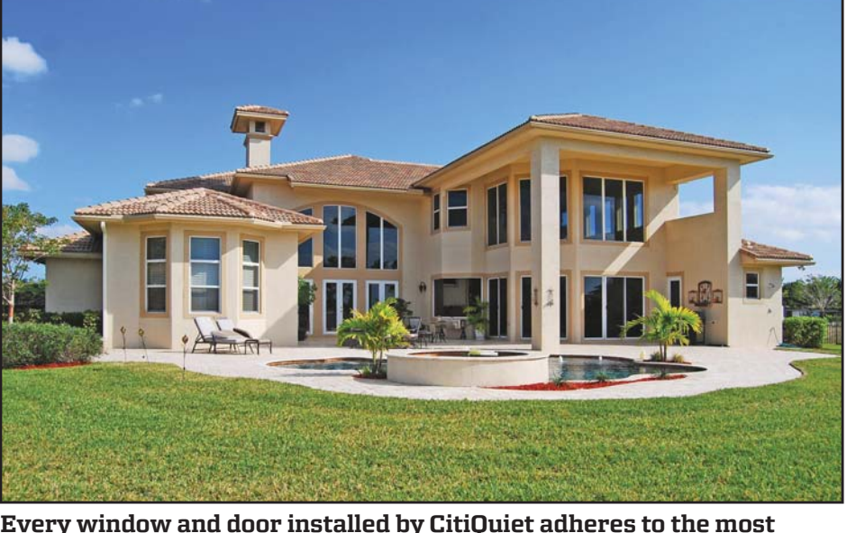
Every window and door installed by CitiQuiet adheres to the most stringent codes in the nation – the Miami-Dade NOA (Notice of Acceptance).

Porcelain is a product that's scratch resistant, durable and stain resistant. "It requires little maintenance, and is an excellent choice for high traffic areas," says Di Sorbo. "We take pride in what we do, and we can work with all budget ranges and tastes."