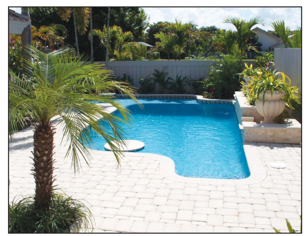
Cliff's Pools & Patios is a one-stop shop for quality resurfacing and tile installation.

Summer is here. It's time to make the smart choice. Call Cliff's Pools and Patios for a consultation.